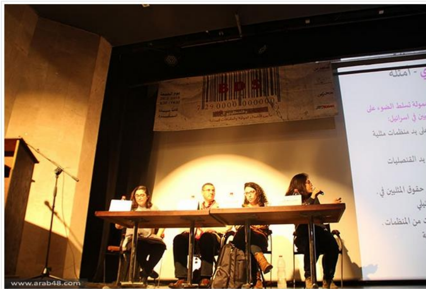
A panel at the conference "BDS and '48 Palestinians: Between International Influences and Local Contexts."